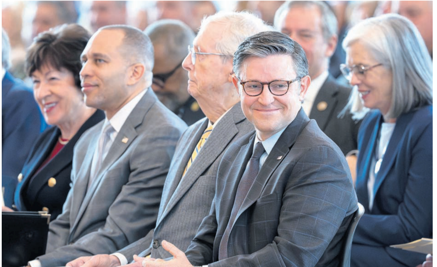
Speaker of the House Mike Johnson, R-La., right, smiles as he is joined by, from left, Sen. Susan Collins, R-Maine, House Minority Leader Hakeem Jeffries, D-N.Y., and Senate Minority Leader Mitch McConnell, R-Ky., as they attend a Congressional Gold Medal ceremony for surviving members of a top-secret WWII unit, at the Capitol in Washington, Thursday, March 21, 2024.

Then it would move to the Senate where senators would have to agree on taking it up expeditiously to avoid a partial shutdown. Usually, such agreements include votes on proposed amendments to the bill. Johnson described the bill as a serious commitment to strengthening national defense while expanding support for those serving in the military. The bill provides for a 5.2% pay increase for service